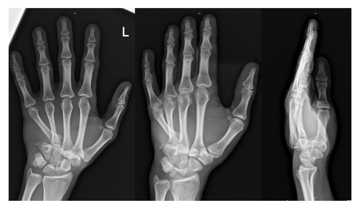
Fig. 1. Anteroposterior, oblique and lateral radiographs of the patient's hand showing dislocation of the second to fifth CMCs with avulsion at the base of the fifth metacarpal bone.