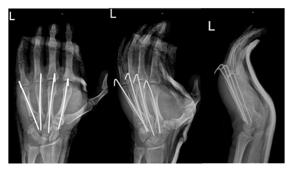
Fig. 2. Anteroposterior, oblique and lateral radiographs of the patient's hand showing congruency of the second to fifth CMC joints following K-wire fixation.

radiographs confirmed congruent joints of the left 2nd to 5th CMC joints. The patient's left hand was immobilized for 6 weeks, at which time the K-wires and slab were removed, and he began physical therapy for finger stiffness. Three months after the operation, he had regained complete and painless mobility of the wrist, with full hand grip (Fig. 3), and 6 months after the injury, he had returned to performing intense physical exercise using the affected hand without problems. A plain radiograph was done at 3 months and showed a minimally displaced small fragment at the base of the 5th metacarpal bone without any dislocation or subluxations of the other CMC joints (Fig. 4). He was very