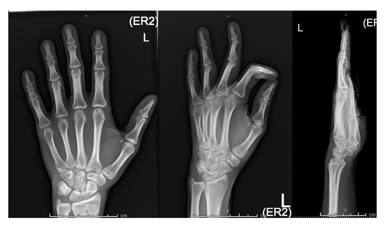
Fig. 4. Anteroposterior, oblique and lateral radiographs of the patient's hand showing well-congruent second to fifth CMC joints with a minimal non-union at the base of the fifth metacarpal bone.

fractures, an incidence of less than 0.2%. Regarding the anatomy of the CMC joints, the fifth CMC joint is a saddle joint similar to the thumb CMC joint that leads to the fifth CMC joint having more mobility than the central three CMC joints. Moreover, the fifth metacarpal configuration slopes toward the ulnar side while the fourth CMC is transverse and the base of the 5th CMC joint is the point of insertion of the flexor carpi ulnaris tendon, which are the two factors creating instability in the 5th CMC [3], while dislocation of the central three CMC joints is not commonly seen.