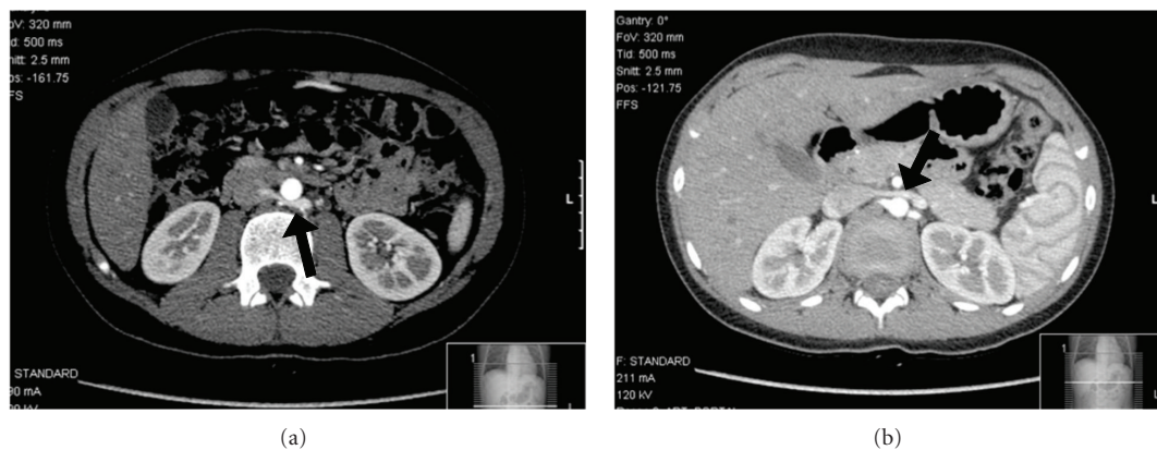
FIGURE 3: (a) Posterior branch of the left renal vein entrapment; (b) normal anterior left renal vein.

The renal nutcracker syndrome management evolved in the last four decades [4, 9, 15], and there are several available options, from close expectant surveillance, endoscopic proceedings (e.g., external or internal stenting [16], and haemostatic agents) to more complex open surgical procedures (e.g., LRV transposition, renal autotransplantation of the left kidney [15, 17]). Patients in prepubertal age should be offered less aggressive forms of treatment since the likelihood of spontaneous remission due to normal physical development [6].