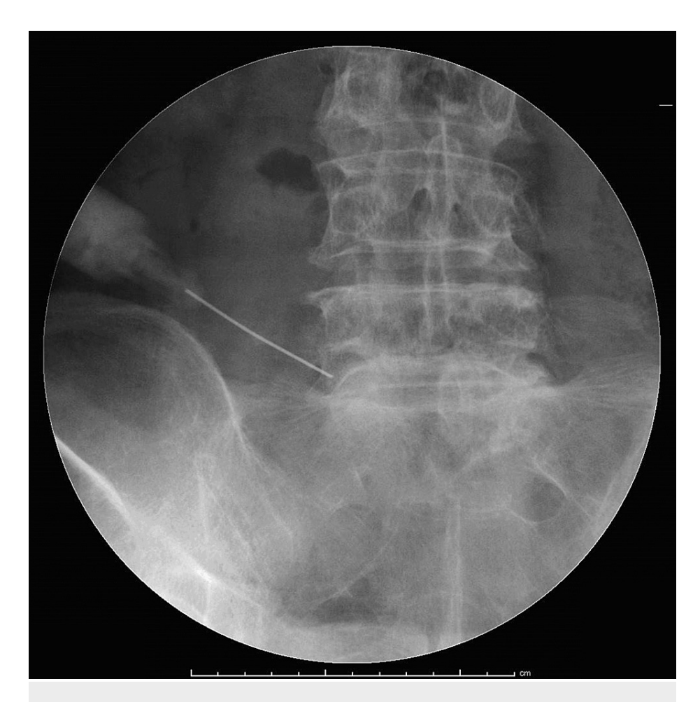
FIGURE 2: Fluoroscopic image at selective nerve root block (SNRB)