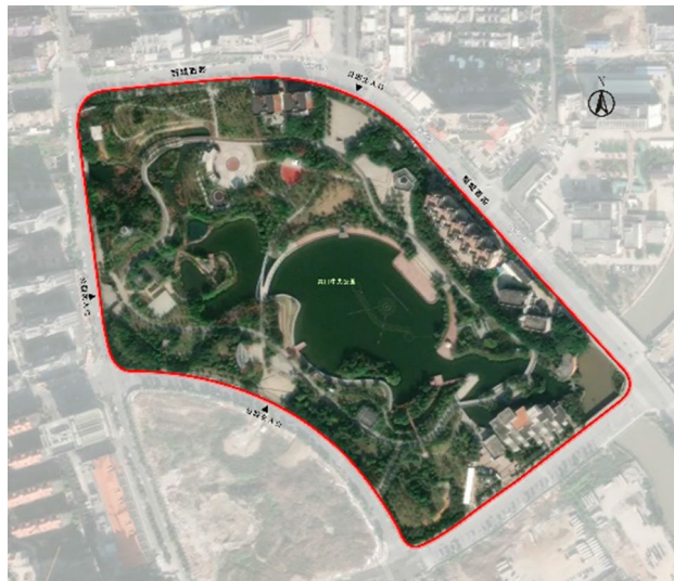
Figure 1. Schematic diagram of the Qingkou Central Park research area.