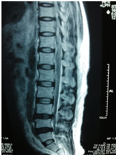
FIGURE 3: MR imaging of dorsolumbar spine did not reveal any abnormalities, with no evidence of compressive myelopathy.

have any prior episodes of gastrointestinal bleeding and the terminal episode of lower gastrointestinal bleeding due to diffuse portal colopathy did not have any antecedent event. Secondly, he had confounding exposure to grass pea, known colloquially as khesari dal ( Lathyrus sativus ). Neurolathyrism is still reported from several states in India, despite extensive awareness programmes about its debilitating neurological effects [14]. The toxin beta oxalyl amino alanine (BOAA) causes lower limb weakness with gluteal atrophy. However, our patient reported infrequent intake of the legume, the weakness was symmetrical, without bladder involvement, and there was no loss of reflexes. The reported toxic dose is about 300 gm of the legume per day for a period of three months [15]. While we were able to exclude certain diagnoses in this case, in view of the long duration of neurological symptoms, the possibility of concomitant predisposing factors like chronic