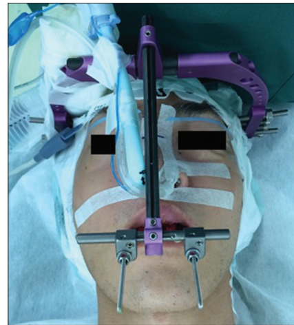
Figure 1: Rigid external distractor frame in situ small round mask for preoxygenation. A RED frame on a patient

One month later, they underwent removal of the RED frame. A small-size rounded facemask that could adequately cover their nose below the horizontal bar of the RED frame was selected for pre-oxygenation [Figure 2]. Anaesthesia was induced