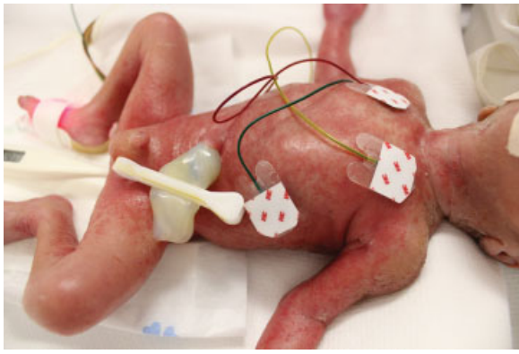
Fig. 1 At birth, diffusely distributed erythematous papules and pustules were present on the infant's face, trunk, and extremities.

in respiratory distress. The infant was intubated, and an endotracheal surfactant was administered. He had diffusely distributed erythematous papules and pustules on his face, trunk, and extremities (►Fig. 1). His total blood cell count included a total leukocyte count of 4.3 \times 10^9/L with 7.5% band forms, 43.0% polymorphonuclear leukocytes, and 33.5% lymphocytes, and a platelet count of 255 \times 10^9/L . A laboratory examination revealed a C-reactive protein level of 0.26 mg/dL and an immunoglobulin M (IgM) level of 3 mg/dL. A blood culture was negative. Culture samples obtained from the skin, pharyngeal mucus, gastric fluid, and tracheal aspirates were subsequently found to be positive for Candida albicans . Empiric antibiotic therapy with flomoxef was initiated according to our routine protocol. As the infant's skin lesions were characteristic of Candida infection, intravenous fluconazole (4 mg/kg) was promptly administered. Clotrimazole was also used to treat the patient's skin lesions. After 1 day, his erythematous papules and pustules had markedly improved. Fluconazole was administered every third day for the first 7 days of life, which resulted in improvements in the patient's skin lesions and laboratory data. No major complications, such as patent ductus arteriosus, intraventricular hemorrhage, or fungal infection recurrence, were observed during the neonatal period. The infant was successfully extubated after 42 days of mechanical ventilation and placed on