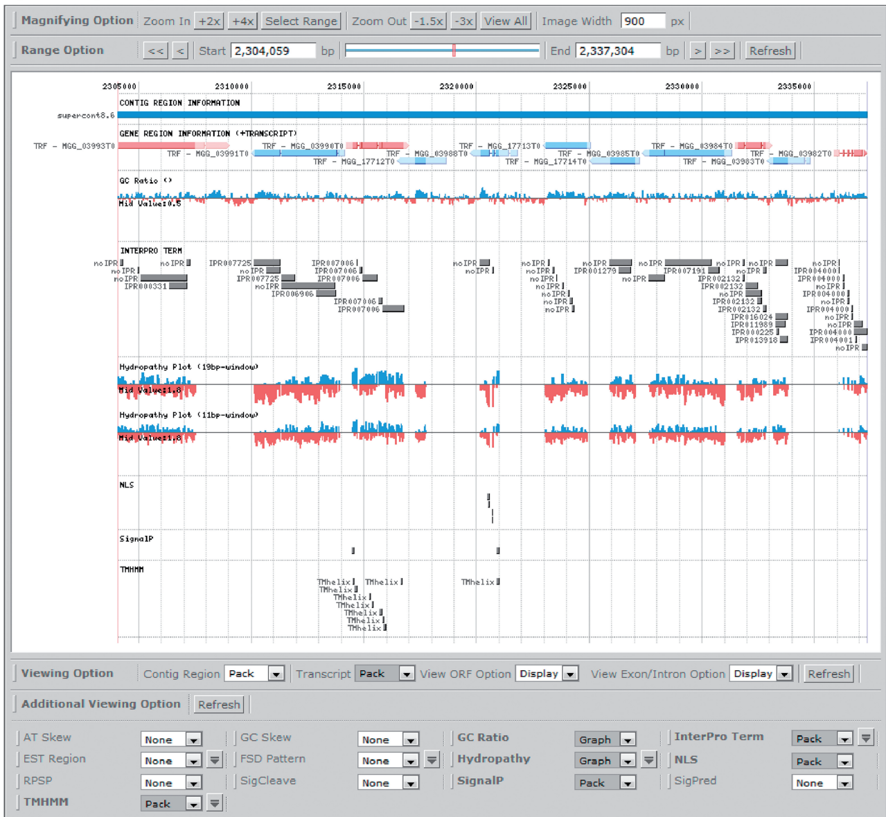
Figure 3. A screenshot of SNUGB implemented in CFGP 2.0. SNUGB allows users to view 13 biological features and the gene structures in the selected genome region. Those features include GC contents, functional domains, nuclear localization signals, signal peptides and trans-membrane helices.

supercont8.6 (Total Length : 4,133,993bp)