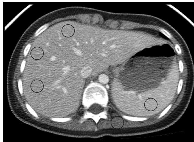
Fig. 4. Measured diameters of areas of interest for attenuation.

No correlation was observed between amount of blood loss and LMR ( r=-0.159 ) as an aggregate. This held true for PD ( r=-0.08 ) and DP ( r=-0.185 ) when analyzed separately. Furthermore, use of postoperative pancreatic enzymes did not correlate with LMR as an aggregate ( p=0.45 ) or by surgical type ( p=0.98 ).