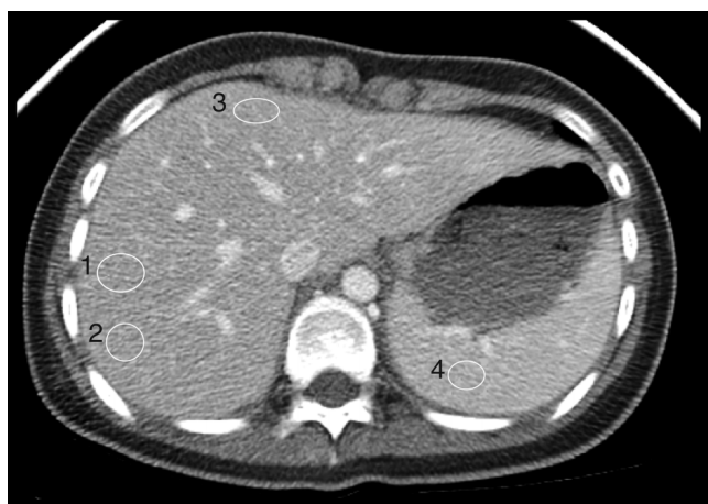
Fig. 3. Areas of interest for attenuation measurement.

There was no significant effect of pre- and postoperative periods and surgery type on LMR ( p=0.59 ). The presence of malignancy, as determined by pathology, did not significantly influence LMR postoperatively ( p=0.96 ) nor did the use of chemotherapy (when divided in 5-fluorouracil based therapy, gemcitabine based therapy, and no chemotherapy). There was no interaction observed between surgical groups, cancer, and the preoperative and postoperative periods ( p=0.82 ). There was also no interaction between \Delta LMR and surgical group with AST, ALT, alkaline phosphatase, and TB (all p>0.05 ).