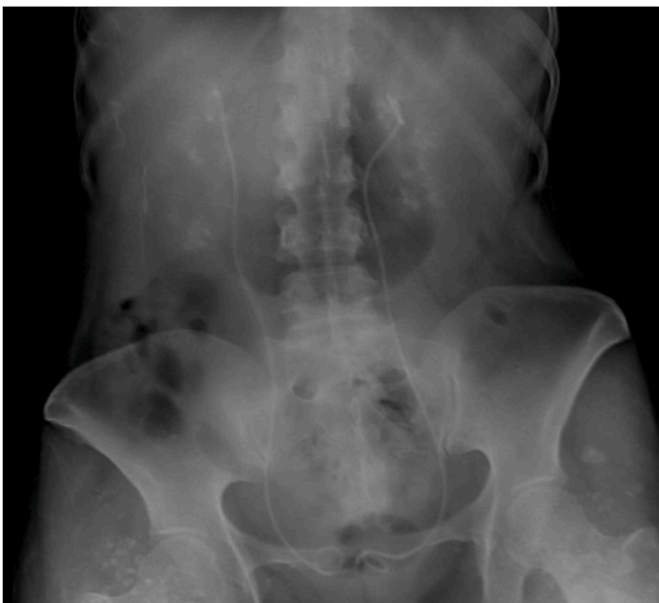
Fig. 1. KUB X-ray showing bilateral nephrocalcinosis and the two double-J catheters in place.

Dating back to 1894, site enhancement oils were first used as fillers to remove facial wrinkles and augment certain body parts, such as the breasts. Synthol, a famous site enhancement oil, has been used by bodybuilders since 1996 to augment muscle size [4]. It is composed of 85% oil (medium-chain triglycerides), 7.5% lidocaine, and 7.5%