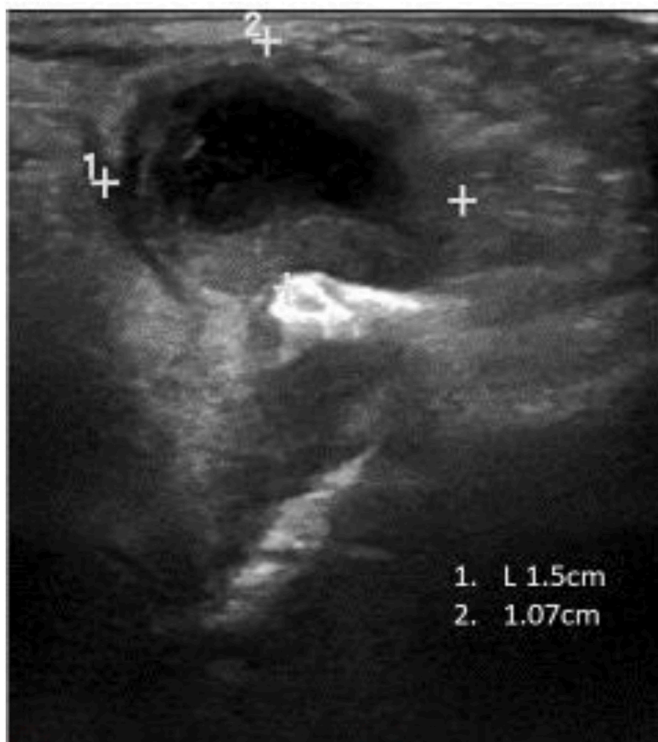
Fig. 1. Real time ultrasound of mass below right eye. The scans and measurements indicate a complex thick-walled cystic lesion in subcutaneous tissues of the orbit, measuring approximately 1.5 cm horizontally X 1.07 cm anterior-posteriorly. The companion Doppler studies indicated prominent surrounding vascularity.

Ocular coccidioidomycosis can present as anterior segment, intraocular and extraorbital lesions. 7 The clinical manifestations include phlyctenular conjunctivitis, episcleritis, scleritis, keratoconjunctivitis, lid granulomata, iridocyclitis, choroiditis, chorioretinitis, endophthalmitis, nerve paralysis, anisocoria, papilledema, optic nerve granuloma, and optic atrophy. 7,15,20 Ocular involvement is usually associated with disseminated disease 7,8,15,20–27 ; however, several cases have been reported without clinical evidence of systemic disease. 15,24 Orbital coccidioidomycosis should be considered in individuals, especially in