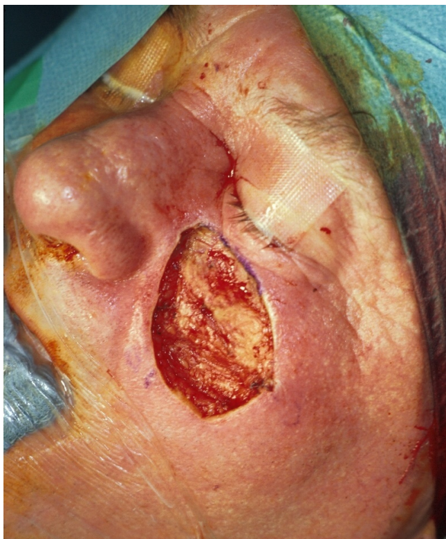
Figure 3 Clinical finding after first surgery: Intraoperative defect, 4 × 2.5 cm 2 in size.

debatable. In many cases the resulting extensive resection defects require large secondary plastic reconstruction.