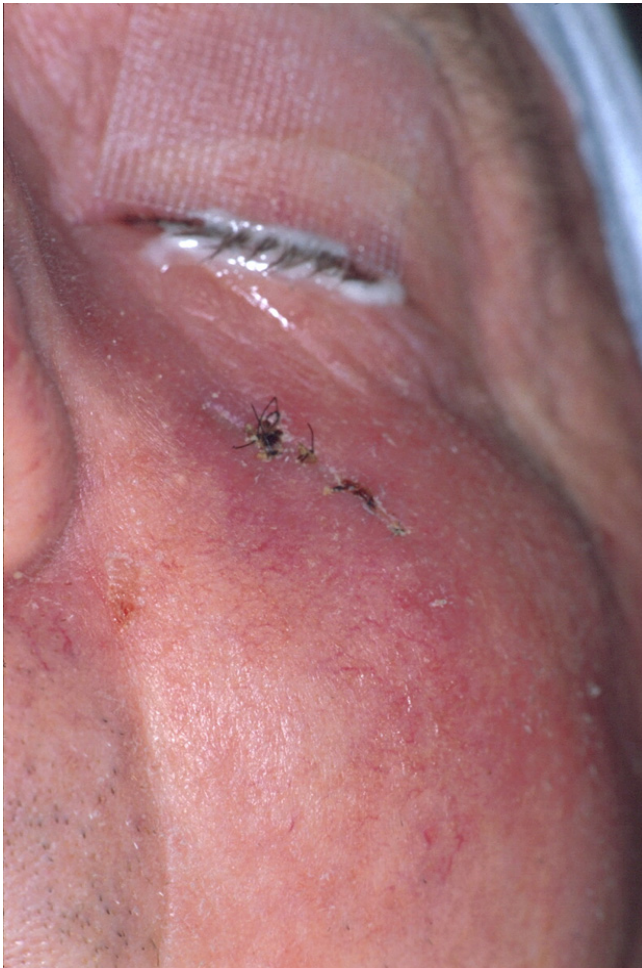
Figure 1 Clinical appearance after first incisional biopsy: Dis- creet skin erythema below the left eye.

tiated. Because of the persistence of the lesion, an incisional biopsy was performed three weeks later (Figure 1). Histopathology of the specimen showed an invasively growing tumour of the dermis, composed of atypical vascular endothelia in a disordered manner, forming bizarre vascular lumina. The tumor cells were characterized by an elevated proliferated activity with a proliferation fraction (MIB-1) of 5%–10%. The vascular endothelial proliferation showed a papillary architecture accompanied by small lymphocytes. The majority of endothelial cells presented a hyperchromatic nucleus and a swollen cytoplasm. (Figure 2a, 2b, 2c). Immunohistochemical studies demonstrated positivity for CD 31 (Figure 2d) and factor VIII-related antigen. Based on these findings the diagnosis of a cutaneous angiosarcoma was made.