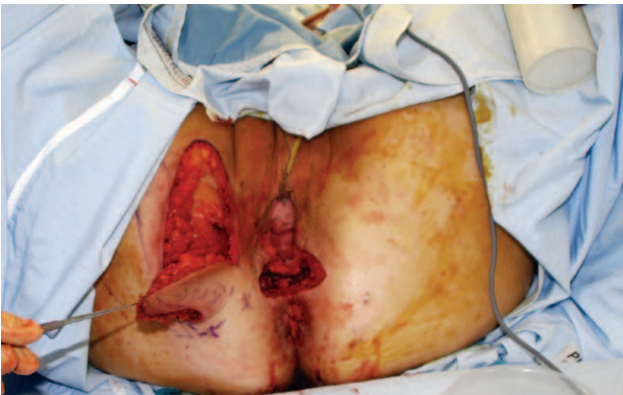
Fig. 2. Intraoperative picture showing the harvesting of the Ipap flap and the perineal defect after en bloc fistulectomy and excision of the perineal scar.