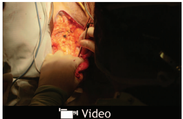
Video 1. See video, Supplemental Digital Content 1, which displays an intraoperative video demonstrating the surgical steps of the repair of a recurrent benign recto-vaginal fistula. This includes the fistulectomy and primary closure of the vaginal and low rectal opening followed by immediate reconstruction of the rectovaginal septum and the concomitant deficient perineal skin simultaneously with internal artery perforator flap (Ipap). This video is available in the "Related Videos" section of PRSGlobalOpen.com or available at http://links.lww.com/PRSGO/A243 .