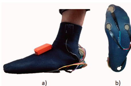
Figure 1. Sensors positioning on subject. (a) Position of IMU on participant's foot; (b) position of footswitches under participant's foot.

All subjects were equipped with two Inertial Measurement Units (IMUs, MTw, Xsens Technologies—Enschede, The Netherlands) attached on the instep of both feet and eight force resistive sensors (Wireless, Wave EMG, Cometa—Milan, Italy), four under each foot, as shown in Figure 1.