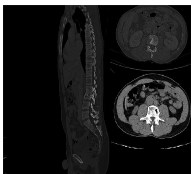
Fig. 3 – CT scan after the end of treatment showing no abscess and resolution of active osteomyelitis.

In conclusion, a salvage regimen containing bedaquiline proved effective in treating MDR tuberculosis spinal infection without causing severe adverse effects. However, further