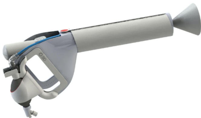
Figure 1 The Odon Device. Courtesy and Becton, Dickinson and Company reprinted with permission.

length of stay, and babies are less likely to be admitted to the neonatal intensive care unit (NICU). 8