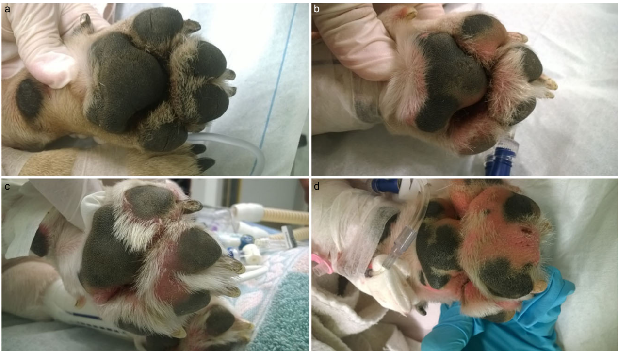
Figure 1. Grading (0-3) of false paw pads in English bulldogs with examples of digital images used for evaluation. a) Grade 0; b) grade 1; c) grade 2; d) grade 3.

slice thickness was 2 mm, feed/rotation 4 mm and reconstruction increment 0.5 mm.