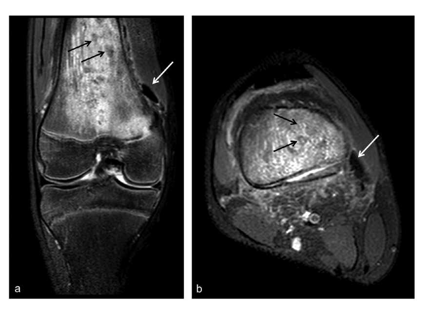
Fig. 3 – Coronal (a) and axial (b) T2-weighted fat-suppressed MR images of the right knee demonstrate intense bone marrow edema of the distal femur, with intramedullary fat globules (black arrows) and extramedullary fat globules (white arrows).

the spread to cortical bone via Haversian and Volkmann's channels. When the infection reaches the periosteum it may result in cortical breech and extraosseous involvement [10]. Bone marrow necrosis due to infection results in the release of free fatty globules [9]. Those fat globules may be liberated to extraosseous compartments through cortical breaches [10].