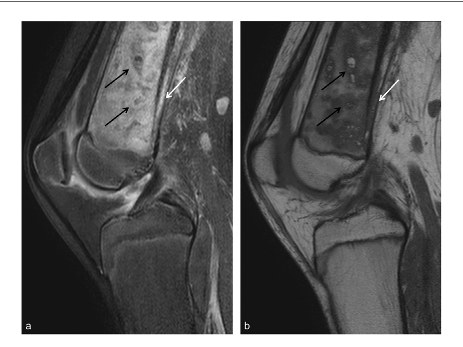
Fig. 2 – Sagittal T2-weighted fat-suppressed (a) and sagittal T1-weighted MR (b) images of the right knee show intramedullary fat globules (black arrows) and subperiosteal fluid on distal femoral shaft (white arrows).