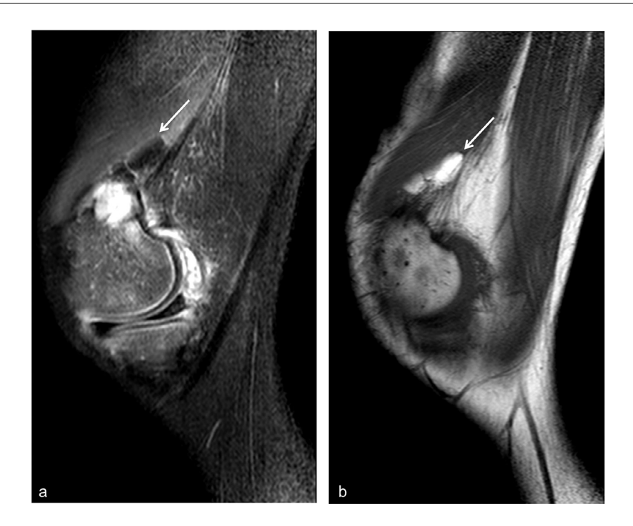
Fig. 4 – Sagittal T2-weighted fat-suppressed (a) and sagittal T1-weighted MR (b) images of the right knee show extramedullary fat globules (white arrows).

sity on T2-weighted and other fluid sensitive MRI sequences [3,11,12]. Fat saturation sequences are useful to differentiate bone marrow edema from the fatty tissue of bone marrow and subcutaneous tissue [10]. Other imaging signs that may help in the diagnosis of osteomyelitis include focal bone destruction, periosteal reaction, and sequestrum [7]. Additionally, intramedullary and extramedullary fat globules are also signs that can improve MR specificity, since they are secondary to fat released by medullary lipocytes after necrosis [8]. In a study with 100 osteomyelitis subjects, Davies et al. reported that in patients ranging from 9 to 42 years old, 70% (12 out of 17 patients) had MRI findings of intramedullary or extramedullary fat globules.