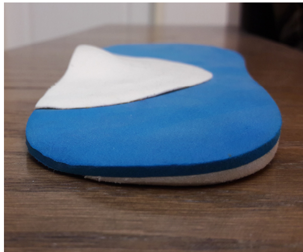
Fig. 1. Lateral Wedge Insole for the Right Foot

An examiner assessed all individuals at baseline and