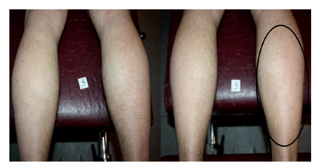
Fig. 2. Rubor elicited in a typical instrument-assisted soft-tissue mobilization (IASTM) intervention volunteer (area circled).

Fig. 3. Ankle range of motion and pressure-pain sensitivity before and after instrumentassisted soft-tissue mobilization (IASTM) and active self-stretch.