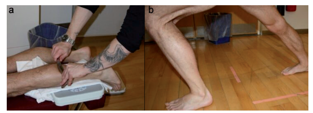
Fig. 1. Instrument-assisted soft-tissue mobilization (IASTM) and stretch intervention set-up.

Once a participant was randomly allocated one stocking was removed and IASTM performed on the triceps surae, followed by active stretch of the contralateral muscle. Participants were positioned lying prone with an analogue scale (KORONA, Sundern, Germany) beneath the leg being exposed to IASTM (Fig. 1a). Care was taken to place sufficient cushioning between the scale and tibia to avoid experiencing discomfort from this contact point. The convex, sharp edge of the IASTM device (Fig. 1a) (15) was placed in contact with the gastrocnemius muscle at 45°, and upward strokes were applied in a range of between 4 and 5 kg. A lubricant consisting of coconut oil and beeswax was administered on the treatment surface to reduce friction to the skin prior to the intervention. Three minutes of IASTM was performed, using a metronome set to 90 beats per minute. Stretch was performed in the same fashion as a-ROM measurement, with the difference being that the stretch position was maintained for 3 min (Fig. 1b).