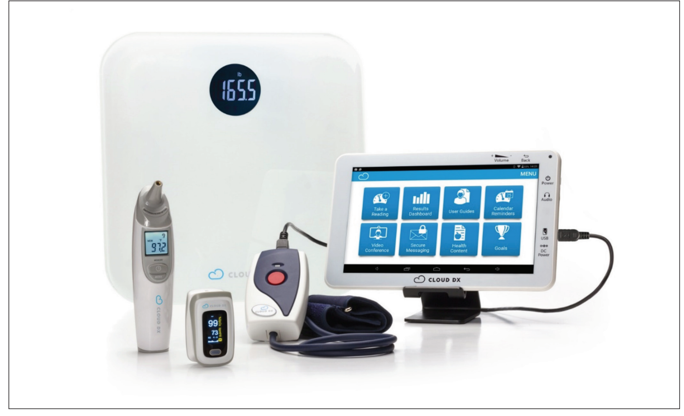
Figure 2: Cloud DX Connected Health Kit, including Bluetooth-enabled Pulsewave wrist cuff blood pressure monitor, body weight scale, wireless oximeter and temperature probe, paired with Android health tablet.

Research staff teach patients assigned to receive virtual care with RAM how to use the cellular modem–enabled tablet computer and RAM technology from Cloud DX (Figure 2). Daily for 30 days, patients take biophysical measurements and complete a recovery survey, and nurses review these results (Appendix 1C).