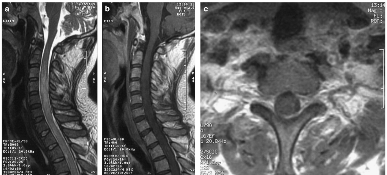
Figure 3 Cervical spine MRI performed on posttraumatic day 23. (a) The T2-weighted sequence showed increased signalling and swelling between C2 and the upper thoracic cord. (b) The T1-weighted sequence showed heterogeneous intramedullary signal. (c) Axial T2-weighted image obtained at the C5 level showing an obvious swelling of the cord.

myelomalacic changes can be observed on MRI, which is characterised by sharply circumscribed areas of high signal intensity in the central and posterior cord on T2-weighted sequences and low signal intensity on T1-weighted sequences. 11,15