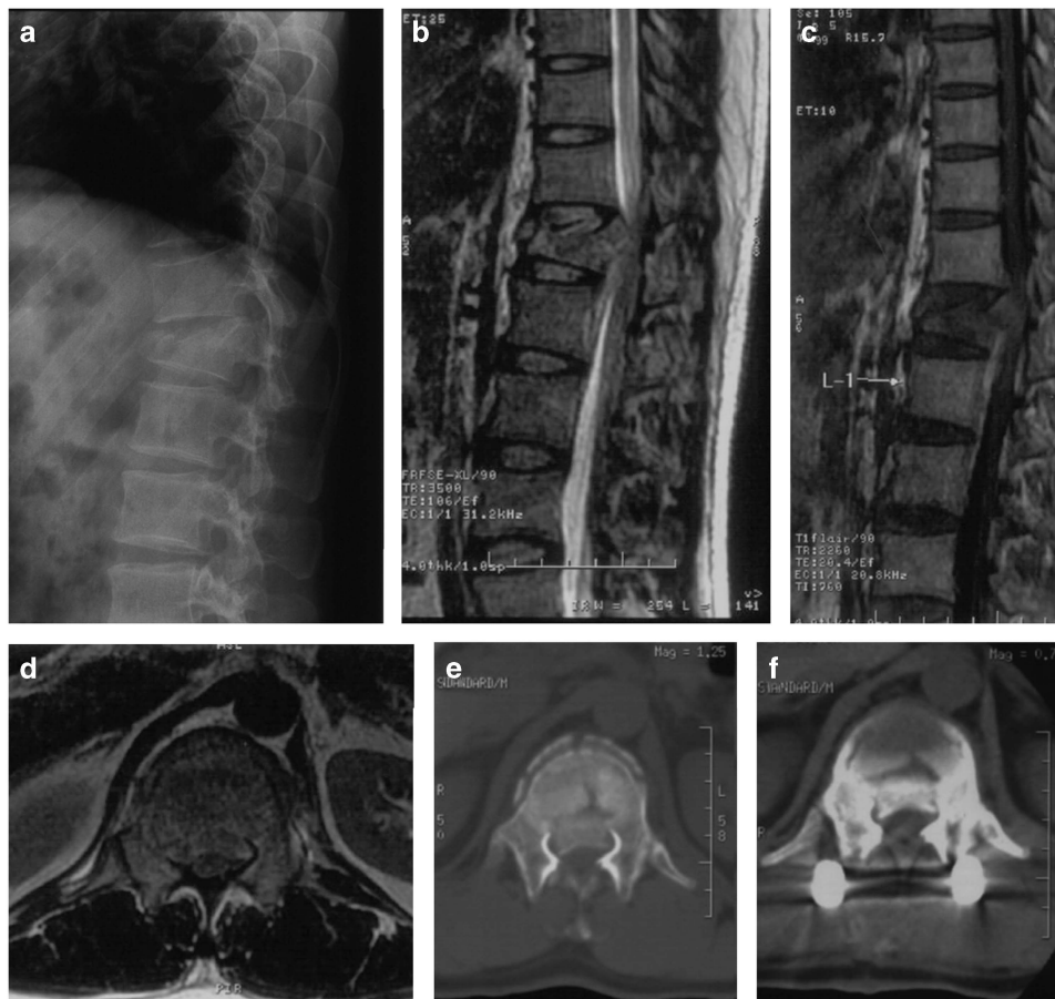
Figure 1 Preoperative plain radiography, computerised tomography (CT) scan and MRI showed a T12 burst fracture with severe canal compromise (a–e). (a) X-ray of the thoracolumbar in a lateral view; (b) MRI sagittal view of the thoracolumbar T2-weighted sequence; (c) MRI sagittal view of the thoracolumbar T1-weighted sequence; (d) MRI axial view at the injured site; (e) Axial CT scan at injured site. Postoperative CT scan revealed there was still a canal compromise (f).

Changes observed on MRI usually did not coincide with the clinical neurological deterioration. MRI changes could occur without a detectable neurological deterioration. 11,15 MRI scans showed improved condition over time. 14,16 Additionally, follow-up imaging of the cord appears atrophic, 8,12 with significant reduction in the cord signal, and swelling with clean borders can be observed in the ascending region on T2W sequences. 6,9,12 Over 1 year,