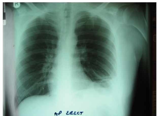
Figure 3. Post-Operative Chest X-Ray Showing Resolution of Diaphragmatic Hernia