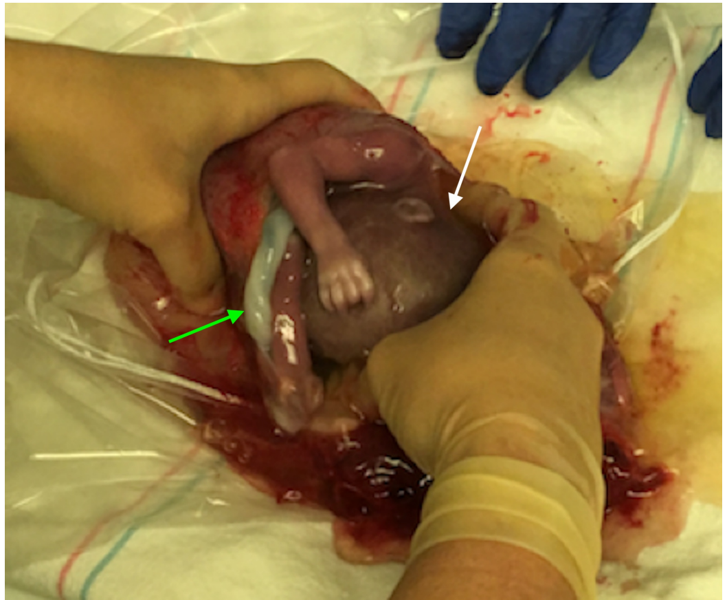
FIGURE 4: Intraoperative photograph of the intact stillborn fetus (white arrow) in the sac along with the placenta (green arrow) being delivered.