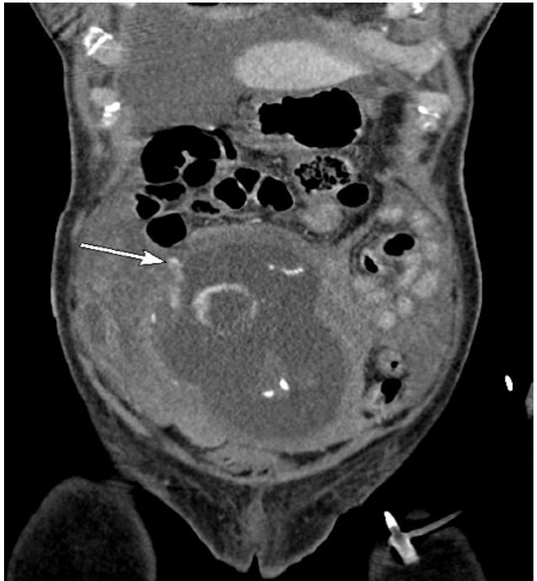
FIGURE 1: Computed tomography of the abdomen and pelvis.

Shortly after her arrival, the patient's blood pressure decompensated to a low of 85/50 mm Hg in the emergency department. A contrast-enhanced computed tomography (CT) was performed which showed fundal discontinuity and active extravasation of contrast into the peritoneum (Figures 1, 2). Additionally, her scan showed a large amount of hemoperitoneum confirming the diagnosis of spontaneous uterine rupture. The fetus was within the endometrial cavity at the time CT was performed; however, fetal heart tracing did not show any signs of activity. The patient was urgently transferred to the operating room for an emergent laparotomy. At the time of operation, the fetus and gestational sac were partially extruded from the defect at the uterine fundus seen on CT (Figures 2, 3). The fetus, sac, and placenta were delivered and handed to the pediatricians intact (Figures 3, 4). Subsequently, the fetus was found to be stillborn. There was no active uterine bleeding, so the decision was made not to perform a hysterectomy. A primary repair of the ruptured uterus was performed with 0 Monocryl to achieve adequate hemostasis. The patient's bowel was inspected, all adhesions were lysed, and her abdomen was irrigated with warm saline. Approximately 3.5 L of estimated blood loss into the peritoneum was evacuated. The laparotomy incision was then closed.