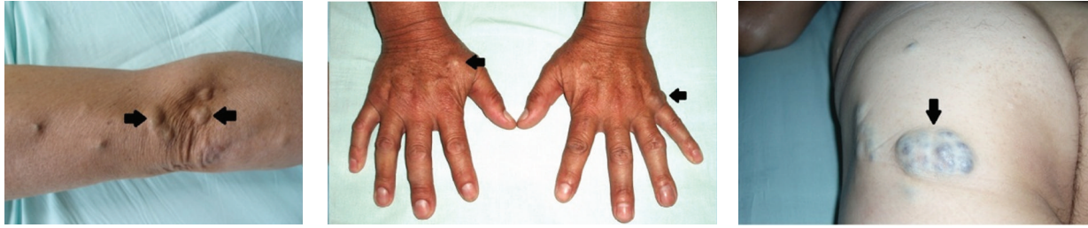
FIGURE 1: Formation of bluish hemangiomas on the arms, forearm, hands, and thighs (arrows).

his age. The lesions had varying diameters (1 cm to 12 cm) and were usually regularly raised mushrooms, resembling small bubbles of blue coloration (Figure 1). One of these skin lesions was located at the elbow and had demonstrated several episodes of bleeding after trauma; it had been excised and sent for examination. The histopathological examination of this lesion confirmed the diagnosis of cutaneous hemangioma. Upon physical examination, the patient was in a good general condition with severe mucocutaneous pallor. The examination of the skin on the body's surface showed numerous injuries resembling raised mushrooms with soft consistency and depressive compression that most often involved the trunk and upper limbs. The red blood cell counts showed severe anemia (Hemoglobin 6.1 g/dL) and hypochromic microcytosis with the presence of 4% reticulocytes. The serum iron level was 18 mg/dL. Upon digital rectal examination, we found blood on the glove without palpable masses.