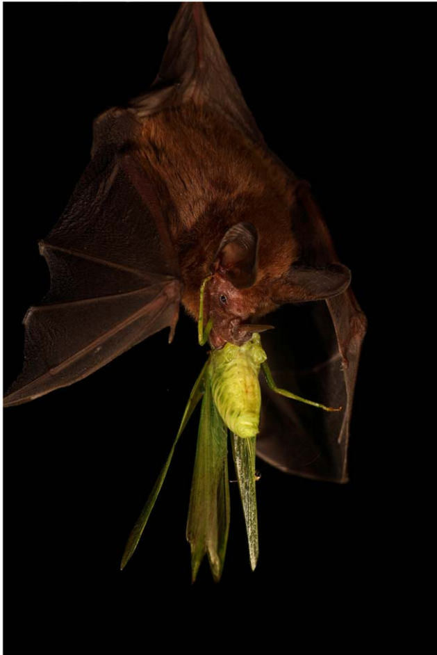
Figure 1. Micronycteris microtis consuming a katydid. This image illustrates the relatively large size of some prey items included in the diet of this bat. doi:10.1371/journal.pone.0028584.g001

strongly predicted by cranial morphology [23,24] and is a determinant of the prey that are included in the bats' diet [20]. Recent studies also suggest that most animal-eating species exhibit low plasticity in this performance trait, that is, these bats do not switch their biting behavior as much as frugivores do in response to prey hardness [21]. Insectivores mainly process prey using their molars, and the structure of these teeth is closely associated with their ability to break down prey [25].