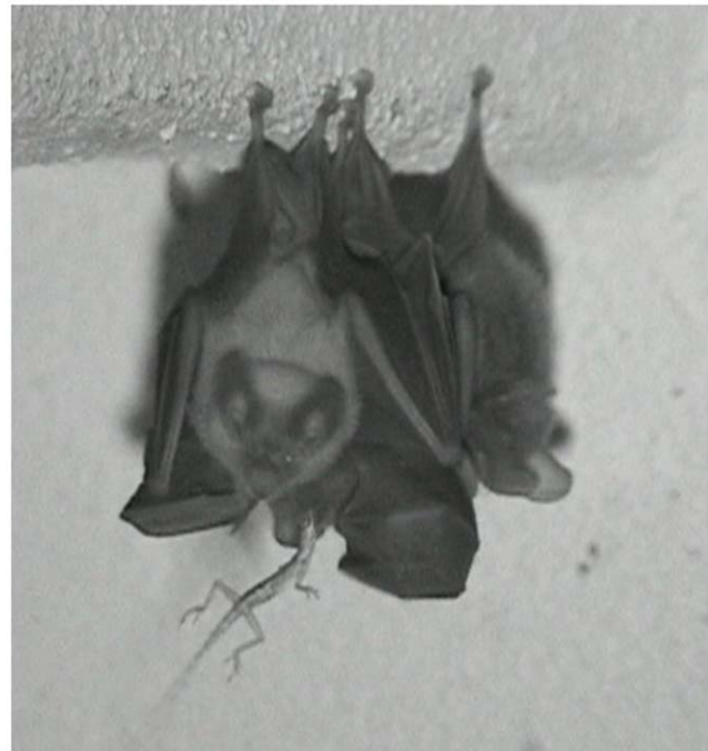
Figure 2. Video snapshot of a group of three Micronycteris microtis , as observed in the roost in Barro Colorado Island, Panama. The individual in the center on the back of the group is eating a lizard. doi:10.1371/journal.pone.0028584.g002

As expected, M. microtis used molar bites predominantly to eat all prey types (Table 1). Nonetheless, the bats changed their feeding behavior significantly with prey type (Table 2). On one hand, they switched between bite types, as demonstrated by the