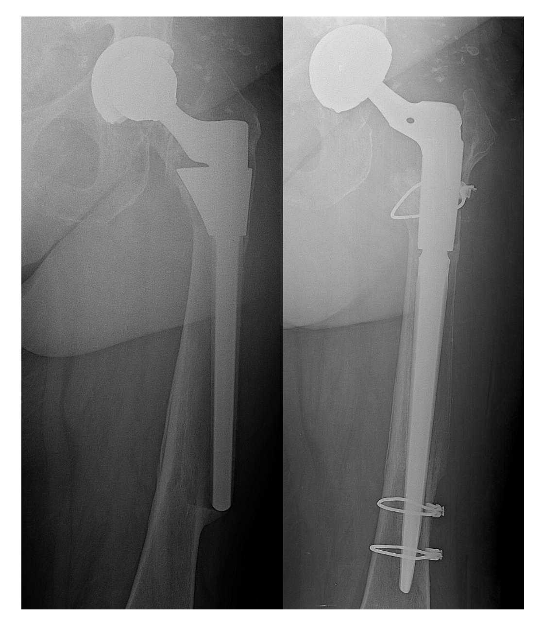
Figure 2. Aseptic loosening of femoral stem—stem and mobile components revision with hydrogel antibacterial coating. On the left side preoperative X-ray; on the right side five months postoperative follow-up.