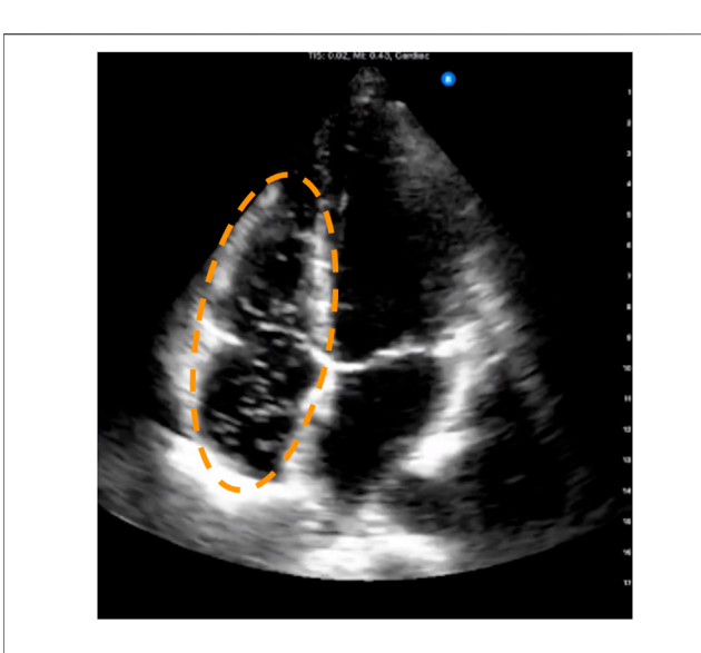
FIGURE 1 | Example frame from four-chamber trans-thoracic echocardiography showing venous gas emboli circulating in the right atrium and ventricle. These appear as bright spots against the dark background that is the blood inside the chambers. The dashed ellipse outlines the venous chambers where venous gas emboli are typically seen when present.

associated with greater risk of developing decompression sickness (DCS) (Nishi et al., 2003) (Eftedal et al., 2007).