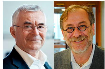
Insights from Rino Rappuoli and Giuseppe Del Giudice.

poorly performing vaccines with important health and economic consequences. Universal influenza vaccines aim to protect against several, if not all, influenza infections (Erbelding et al., 2018). In 1993, a first study described a broadly neutralizing monoclonal antibody specific for an epitope in the conserved region of the HA stalk which was also able to block virus-mediated cell-cell fusion (Okuno et al., 1993). This initial observation was confirmed 15 yr later by the isolation of many monoclonal antibodies cloned from human memory B cells that recognized conserved epitopes in the HA stalk (Corti et al., 2011; Ekiert et al., 2011; Dreyfus et al., 2012). So far, the available vaccine technologies have been used to induce stalk-specific antibodies and increase their poor immunogenicity with the scope to develop a universal influenza vaccine (Krammer et al., 2013; Impagliazzo et al., 2015; Yassine et al., 2015;