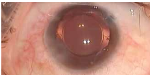
Figure 5. Postoperative anterior segment image