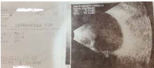
Figure 3. Preoperative B-scan ultrasonography image