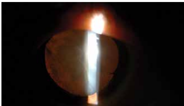
Figure 1. Biomicroscopic anterior segment photograph of the isolated anterior lens capsule extending from 7 to 11 o'clock

We believe that with less severe injuries, expansion following ocular compression on the anterior-posterior axis leads to posterior capsule tear, while in more severe injuries the anterior-posterior axis compression may cause anterior capsule rupture before the subsequent expansion. Especially in young patients like the current case in which the anterior hyaloid is tight, the vitreous compact, and the zonules intact, the anterior capsule rupture is limited to the equatorial plane and does not continue to the posterior capsule. The tight anterior hyaloid likely buffers the force of the direct impact but transfers the energy toward the lens due to the countercoup effect. Therefore, although the retina and posterior pole are protected from trauma, the impact results in anterior capsule rupture because of the elasticity of the lens material. In cases like this, in which the patient is young and the tissues are resilient, the damage is limited and cataractous lens material can be removed by irrigation-aspiration alone, resulting in favorable anatomic and visual outcomes.