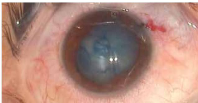
Figure 2. Intraoperative image of the severe traumatic cataract and the anterior lens capsule rupture visualized with trypan blue