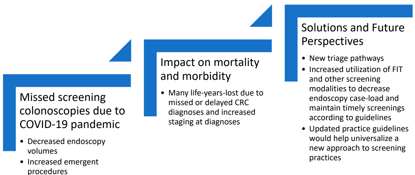
Figure 1. Overview of Impact of COVID-19 on CRC screenings.

Since the onset of the COVID-19 pandemic, new systems have been put in place to gather vast data as variants arise, efficacious vaccines are available and we have gained more knowledge about COVID-19, including the risk of infection in different medical settings. It is important to make up for the backlog of cancer screenings and subsequent deficit of diagnoses in 2020 [8–11]. Colorectal cancer is the third most common cancer and second leading cause of cancer-related death in the United States [12]. There have been an estimated nearly 4 million missed colorectal screening examinations due to COVID-19 [9]. Discernibly, a lack of screenings will result in late or missed cancer diagnoses for many patients. This review highlights trends in colorectal cancer screening, the potential effects on the morbidity and mortality of colorectal cancer, and proposed solutions to overcome the negatives effects of missed cancer screenings. (Figure 1 provides a summary of the key aspects covered by this review).