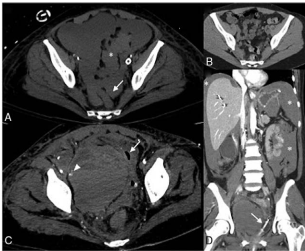
Figure 1. (A) Axial computed tomography (CT) at the level of the sacral promontory shows hemoperitoneum with fluid collection in the pelvis, including the retrouterine space (arrow), enveloping the sigmoid colon (asterisk). (B) Premorbid axial CT of the patient (obtained for abdominal pain) at identical level as in (A) highlights normal pelvic anatomy by means of comparison. (C) Contrast-enhanced axial CT obtained 15 d after that in (A) shows a large right-sided pelvic retroperitoneal hemorrhage with contrast extravasation (arrow-head), posterior compression of the rectum, and leftward displacement of the bladder with intravesical air introduced by catheterization (arrow). (D) Coronal reconstruction of CT from (C) shows the pelvic hematoma displacing an inflated Foley catheter (arrow) and highlights the large hemoperitoneum (asterisks) prior to its evacuation.

The lack of improvement in lower extremity strength after 6 months prompted neuromuscular medicine consultation. The patient had no volitional movement at the level of the ankles, due to which she required solid ankle-foot orthoses to ambulate. She also reported numbness and dysesthesia below the knee bilaterally, saddle anesthesia, and decreased awareness of bowel and bladder distension. Examination confirmed bilateral paralysis and pan-modal sensory loss below the knees, leg atrophy (Fig. 2), weakness (Medical Research Council scale: 4/5) of hip adduction and abduction and knee flexion, and absence of