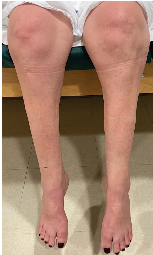
Figure 2. Bilateral flail foot and severe atrophy of anterior and posterior leg compartments.