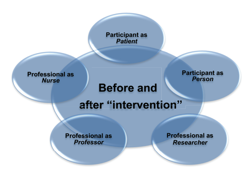
Figure 3 Before and after "intervention" phenomenon.

"This research seems like an ethnography. In order to capture my data I need to be acutely aware of the functioning of each unit and ward, the 'slick', efficient operations