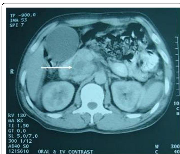
Figure 1 Contrast enhanced CT abdomen showing heterogeneous lesion in the head and uncinate process of pancreas with non enhancing areas suggestive of necrosis (arrow) and distended gall bladder.

The noninvasive diagnostic techniques for pancreatic TB rely mainly on ultrasonography and CT abdomen. Ultrasonography reveals focal hypoechoic lesions or cystic lesions of the pancreas [8]. Findings on CT scan