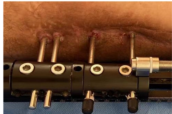
Fig. 2 Grade II infection. There are both skin erythema and purulent discharge around the pin tract