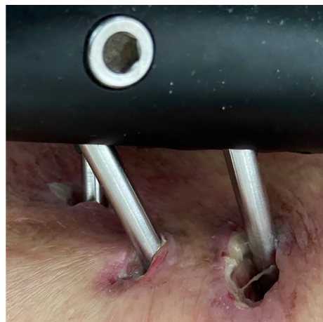
Fig. 3 Grade II infection. There are both skin erythema and purulent discharge around the pin tract