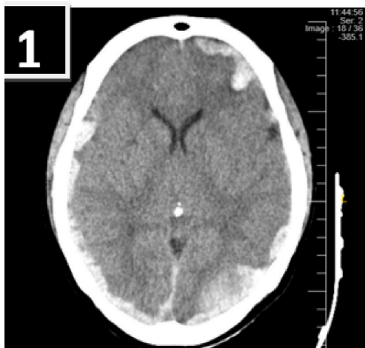
Fig. 1. Acute subdural hematoma in both cerebral hemispheres the deepest area measures 3cm.

In conclusion for patients using anticoagulants, any misinterpretation of variables affecting drug pharmacodynamics and pharmacokinetics should be explored. This will contribute in the patient's plan and pave the way for the other management strategy.