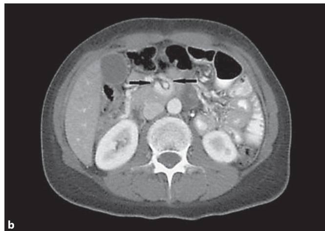
Fig. 2. A 33-year-old woman who had history of gastric bypass 7 years previously presented with abdominal pain and nausea. a Aggregation of small-bowel loops (jejunal) is seen along the left side of the abdomen showing mural enhancement (black arrows). This is associated with engorgement and swirling of the corre-

sponding mesenteric vessels (white arrows). b Mushroom sign, narrowed mesenteric root with passage of intestinal loops between superior mesenteric artery and its branches is clearly demonstrated (black arrows).