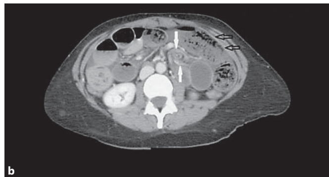
Fig. 1. A 32-year-old female with post-gastric bypass in 2008 presented with repeated vomiting and severe abdominal pain. a Dilated fluid-filled small-bowel loop is seen at the left side of the upper and middle abdomen (black arrow) and is associated with

engorged straightened mesenteric vessels (white arrows). b Mesenteric swirl (white arrows) and anteriorly located small-bowel loops with no covering of omental fat (double open black arrows).