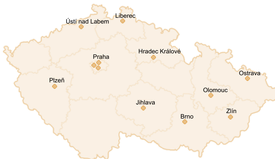
Figure 2 The twelve participating centers in the Czech Republic.

The data will be obtained through regular check-ups every 6 months, as well as in hospital data records search.