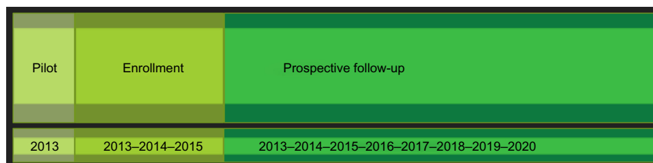
Figure 1 The time schedule of the Czech Multicentre Research Database of Severe COPD.

COPD and its impact in the Czech Republic has not been studied in such detail before, making it the first of its kind.