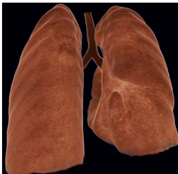
Figure 3. Collapse of the lower lung parenchyma on the right side

A right intrathoracic rib which is articulated on the anterior aspect of the T7 vertebral body and protrudes into the thorax cavity causing collapse of the lower lung parenchyma