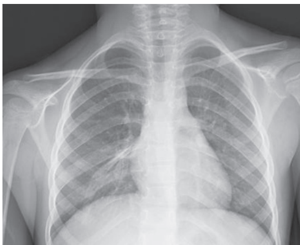
Figure 1. Chest X-ray; right perihilar hyperlucent appearance

There are various types of congenital anomalies of the ribs, including developmental fusion. These anomalies occur in 0.15%-0.31% of the population (5) and the rarest one is an intrathoracic rib. Approximately forty cases have been reported so far until first described in 1947 (6). The development of this anomaly may be explained by both certain alterations in gene expressions and incomplete fusion of the sclerotome, from which the rib originates normally (1,2). They are more commonly asymptomatic, unilateral and on the right side with no gender predilection (2). Approximately one-third of the reported cases are in children. It is usually found incidentally in both the pediatric and adult population and causes misdiagnosis in the majority. The case was also on the right side and was detected incidentally. It did not result in any complaint at all. The first classification of intrathoracic ribs represented in 2006 (7). Type I-a is an intrathoracic rib originating from a vertebral body and type I-b is an intrathoracic rib originating from a rib.