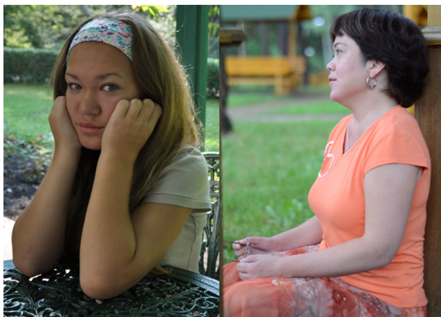
Fig. 2 Pictures of MPS VI patients heterozygous for the p.Y210C mutation

classification systems have also described an intermediate disease form. Other authors suggested other classification systems based on height and urinary glycosaminoglycan (uGAG) levels, the age at the onset of symptoms, patient's height, and the age of death [16, 17]. In reality, there are no fixed parameters to ascribe a particular patient to a single category, and the decision is subjective depending on physician's experience and knowledge. The relatively attenuated disease form is generally characterized by later onset of symptoms which may not at first appear in a recognized pattern, but when apparent, the milder symptoms may be observed by an alert physician and lead ultimately to diagnosis usually after 5 years of age, but it may be delayed until the second or third decades.