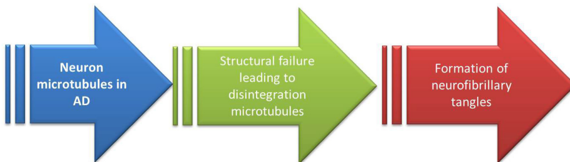
Fig. 2. Representation of Tau Protein tangles.

the cascade [Anand et al., 2017]. Further another theory suggests the mitochondrial dysfunction hypothesis for AD pathogenesis posits that amyloidosis, cell cycle re-entry, and tau phosphorylation are all caused by mitochondrial failure in the AD brain (Swerdlow et al., 2014).