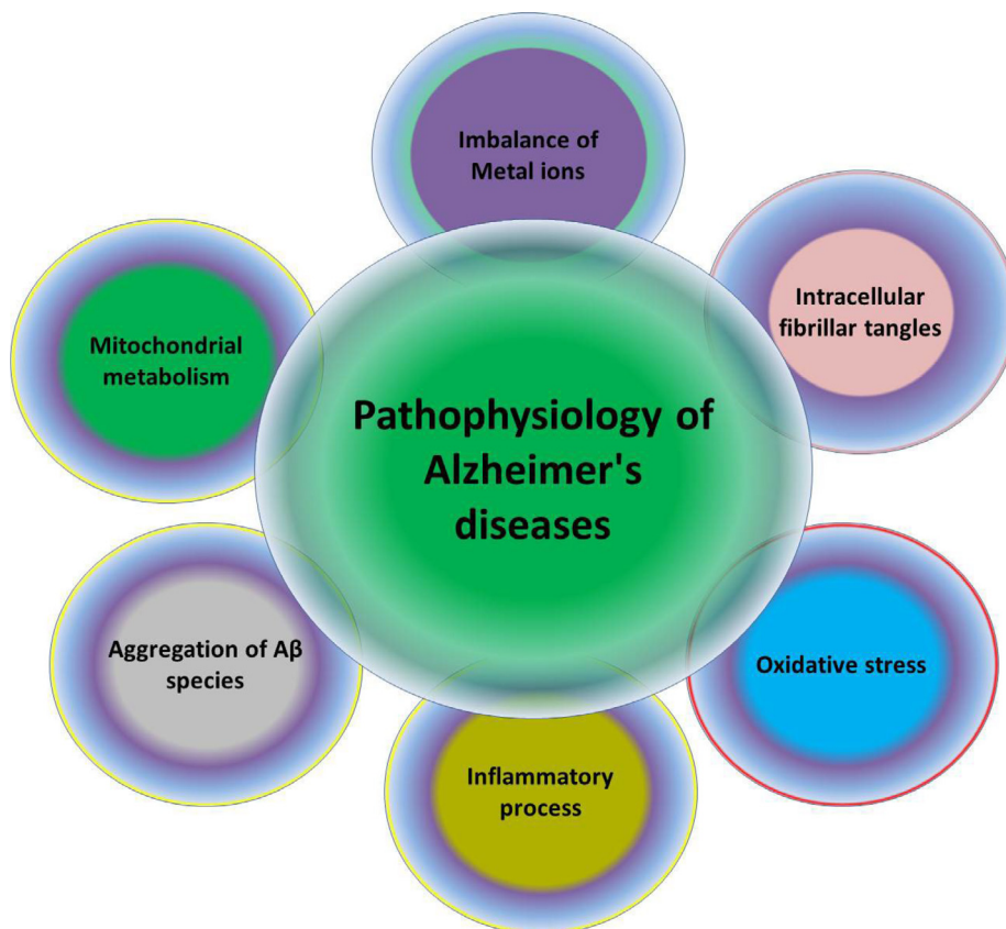
Fig. 1. Pathophysiological features of Alzheimer's disease.

uble and proteolysis-resistant peptide fibrils formed by -amyloid (A) cleavage. After the sequential breakdown of the big precursor protein amyloid precursor protein (APP) by the β- and γ-e -secretase, Aβ peptides with A38, A40, and A42 being the most prevalent forms are generated (Yiannopoulou et al., 2013). β- amyloid (Aβ) cleavage produces highly insoluble and proteolysis-resistant peptide fibrils, which make up amyloid or senile plaques (SPs).. However, if APP is first interacted on and broken by the enzyme α-secretase rather than β-secretase, Aβ is not generated. According to the “amyloid hypothesis,” Aβ production in the brain sets off a chain of events that leads to the clinical symptoms of AD. The formation of amyloid oligomers is primarily responsible for neurotoxicity and commences the amyloid cascade. Local inflammation, oxidation, production of excess glutamate known as excitotoxicity, and tau hyperphosphorylation are all components of