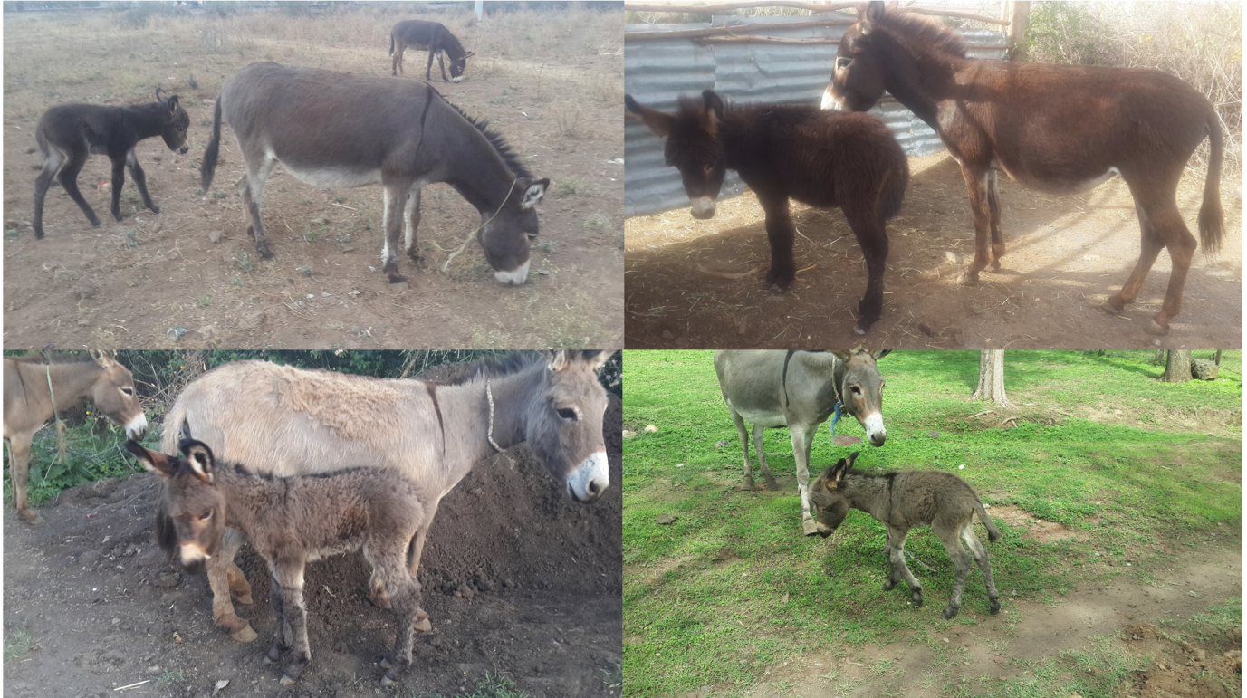
Fig 2. Four of the foals (with their dams) born following artificial insemination performed with frozen-thawed Abyssinian donkey sperm in the present study. No abnormalities were noted in the newborn.

https://doi.org/10.1371/journal.pone.0175637.g002