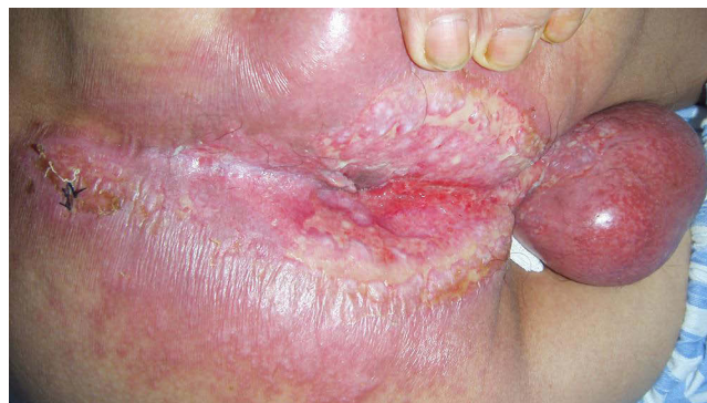
Figure 1 Ulcers around the anus extending to scrotum.

The biopsy of the ulcer indicated a granulomatous inflammation of the infected area (Figure 2a). The colonoscopy revealed the presence of ulcers in the transverse colon, and the biopsy showed a similar feature as the sample from the skin (Figure 2b). The patient did not have any evident symptom of abdominal pain or diarrhea. Although the samples from the diseased skin and intestine were negative for acid-fast staining, smears of the perianal ulcer secretion were positive for tuberculosis bacilli (Figure 3). The computer examination of the chest revealed the presence of old pulmonary tuberculosis. The full blood cell