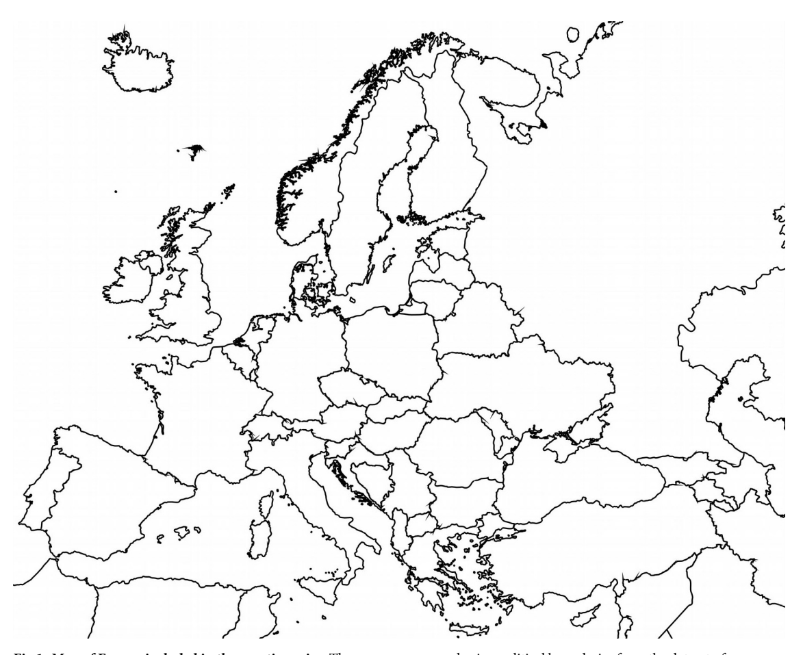
Fig 1. Map of Europe included in the questionnaire. The map was prepared using political boundaries from the dataset of thematicmapping.org.

https://doi.org/10.1371/journal.pone.0260848.g001