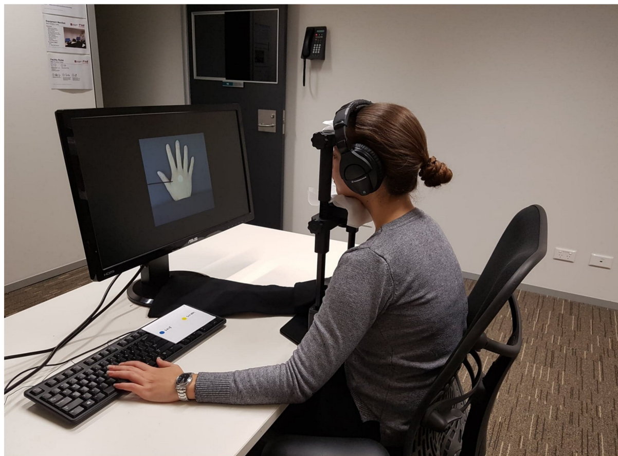
Fig 1. Visual stimuli and experimental setup. (A) Screenshots of the videos depicting touch to either a human hand in a plausible orientation (left), a sponge (middle) or a human hand in an implausible orientation (right). Examples of each of the three condition videos can be found on the OSF page for this project: osf.io/grw57 . (B) Participants watched videos of a hand or sponge being touched and indicated whether the seen touch or the felt touch came first by pressing one of two response keys with their left hand. To mask any noise from the tactile stimulator, participants listened to white noise via headphones. Viewing distance was kept constant with a chin rest.

https://doi.org/10.1371/journal.pone.0224174.g001