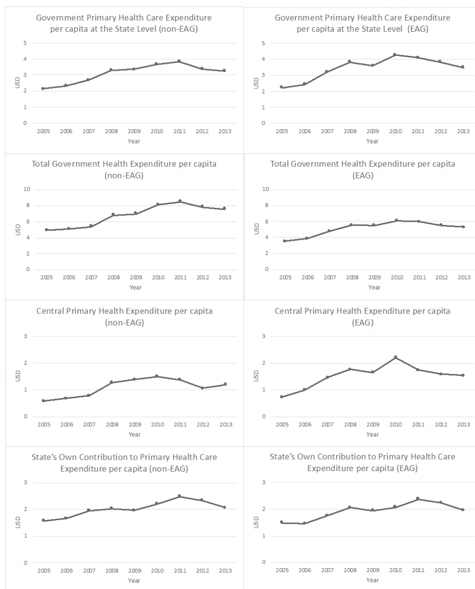
Figure 1. Average Per Capita Central and State Level Government Expenditures for EAG and non-EAG Indian States, 2005-2013, (2005 USD). Abbreviation: EAG, Empowered Action Group.

a Sample size for each variable for each year is N=16 except for year 2007 where Andhra Pradesh had missing figures for the following indicators: GPHCE at the state level, GPHCE per capita at the state level, state's own contribution to primary healthcare expenditure and state's own contribution to primary healthcare expenditure per capita; and year 2007 where Jharkand and Kartanaka had missing figures for the following indicators: state's own tax revenue and state's own tax revenue per capita missing for Jharkand in 2007 and Karnataka in 2009. Exchange rate conversions were extracted for relevant years from the World Bank conversion database. 29