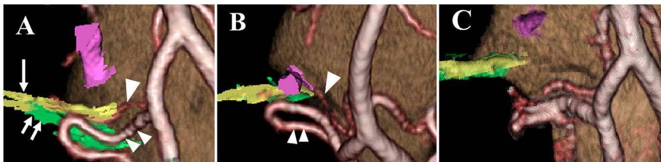
FIG. 1. A: Preoperative 3DMRC/MRA fusion image showing compression of the facial nerve ( single arrow ) and vestibulocochlear nerve ( double arrows ) by the AICA ( single arrowhead ) in the cisterna and posterior compression of the AICA by the PICA ( double arrowheads ). Moreover, the image indicated that the proximal site of the meatal loop of the AICA passing between the facial and vestibulocochlear nerves was compressing both nerves. B: The PICA ( double arrowheads ) has not contacted the REZ. C: Postoperative 3DMRC/MRA fusion image showing new placement of the responsible vessels and decompression of the nerves.

We reviewed the clinical characteristics and surgical findings of four cases, including the present case, to investigate the etiology of comorbid HFS and INN. Ages ranged from 44 to 78 years, with an average of 61 years, and there were two male and two female cases. Two patients (cases 1 and 4) initially suffered from HFS and developed INN during follow-up, whereas the other two patients (cases 2 and 3) suffered from INN and developed HFS during follow-up. In cases 1 and 4, the interval between the onset of HFS and the development of INN was 10 and 20 years, respectively. The interval between the initial presentation of INN and the development of HFS in cases 2 and 3 was 4 and 20 years, respectively. The sequence of HFS and INN can be bidirectional. Long-term follow-up of either INN or HFS should be attentive to the possible development of the second condition. Hearing disturbances and tinnitus were observed in three cases (75%) as cochlear nerve