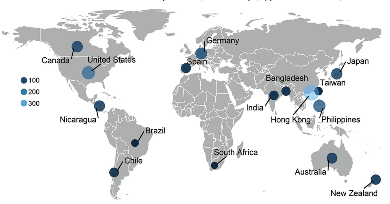
Figure 1. Countries participating in NoroSurv, September 2016–August 2020. Shades of blue and size of circles indicate the number of genetic sequences included from each country.

Throughout the study period, GII.4 Sydney was the most common genotype on all 6 continents and was detected in 52% (687/1,325) of sequences, peaking at 62% (213/343) in 2019-2020 (Figure 2; Appendix Table 1, https://wwwnc.cdc.gov/EID/ article/27/5/20-4756-App1.pdf). The GII.3 (190; 14%), GII.2 (149; 11%), and GII.6 (64; 5%) genotypes comprised 30% of sequences (Figure 2; Appendix Table 1). GI.3 was the most frequently detected GI genotype, accounting for 55% (50/91) of all GI viruses and 4% of all NoroSurv sequences. The remaining 14% (185/1,325) of sequences were composed of 17 other genotypes: GI.1, GI.2, GI.4, GI.5, GI.6, GI.7, GI.9, GII.1, GII.4 Hong Kong, GII.4 untypable, GII.7, GII.8, GII.12, GII.13, GII.14, GII.17, and GII.20 (Appendix Table 1). We detected 687 GII.4 Sydney viruses associated with 3 P-types: P16 (399; 58%), P31 (280; 41%), and P4 (8; 1%). The proportions of each genotype varied by year (Figure 2; Appendix Table 1) and country (Appendix Tables 2-17). The most