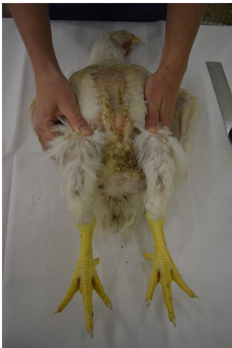
Figure 2. Fixation of the legs at the femorotibiotarsal (knee) joint.

Where Y = VVD angulation, \mu = overall mean, method = method of measuring (1–5), leg = leg (left, right), interaction = interaction between method and leg, e = residual error. Body weight was used as a covariate. Preliminary analysis did not show an interaction effect between method and leg and consequently this interaction was removed from the model. Chicken was used as the repeated subject and a compound symmetry covariance structure was applied.