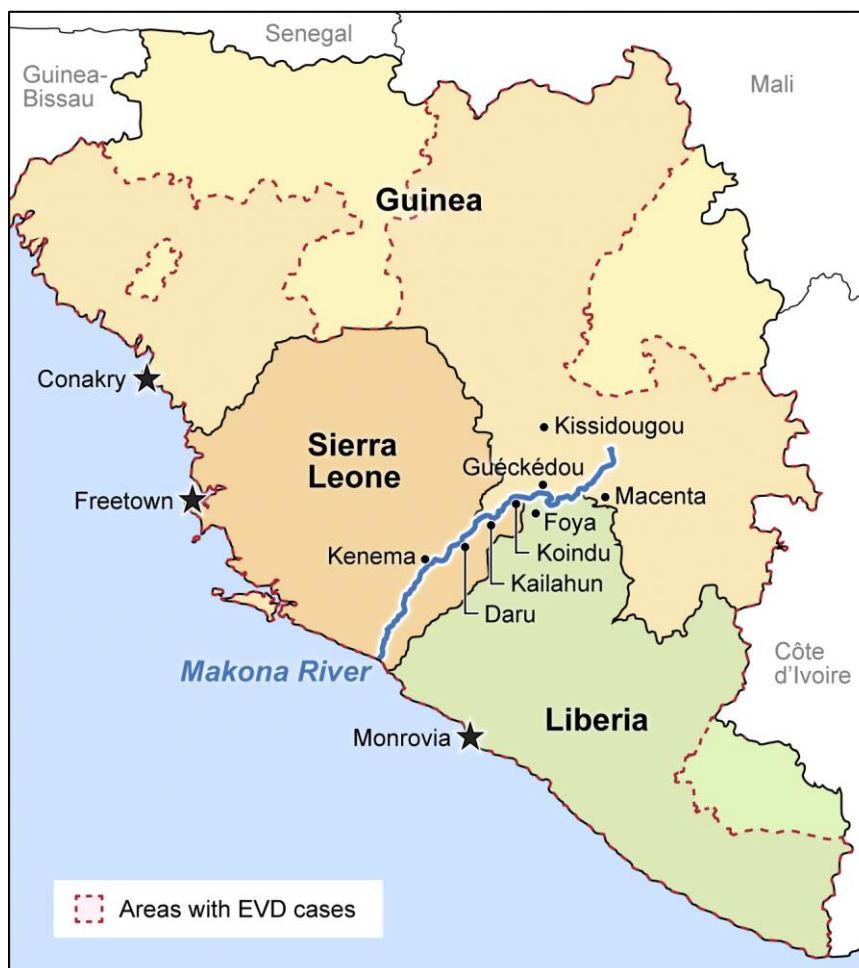
Figure 1. Location of the Makona River.

At the time of writing, 102 coding-complete genomic sequences of EBOV/Mak have been deposited into GenBank, all of which were obtained directly from clinical samples (“p0”) [1,6]. Following the rules laid out in filovirus standardized nomenclature [10], the names for these sequences therefore should contain the <suffix> “-wt”. In addition, one fragment of the L gene of one isolate of EBOV/Mak was deposited. Based on definitions described in standardized nomenclature [10], the corresponding <suffix> field should therefore be filled with “-frag”. All currently deposited sequences stem from either Guinean, Sierra Leonean, or Nigerian samples. The 3-letter country codes to be used the <country> field [10] for all countries that have thus far handled patients infected with EBOV/Mak are summarized in Table 2.